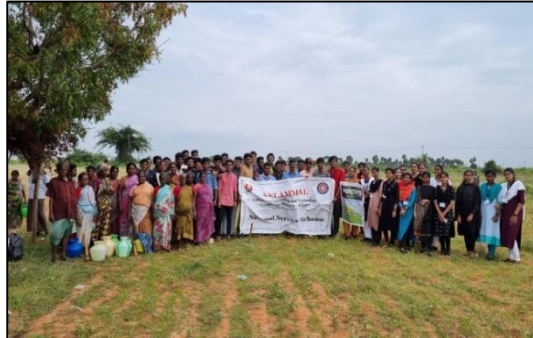
NSS organized a Plantation Camp on 12.12.2022 at Poonchuthi Village, Madurai.