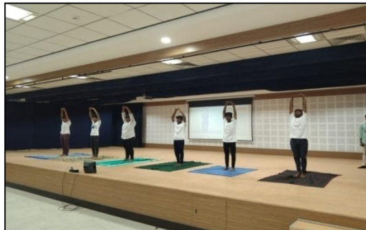
NSS Celebrated “International Yoga Day” - Mass Yoga Demonstration 21.06.2023.