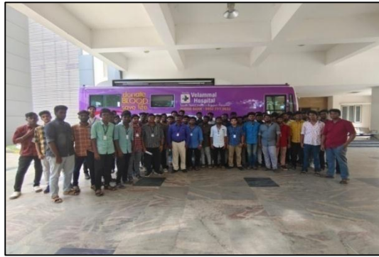
NSS Blood Donation camp at VMCH on 23.09.2022.