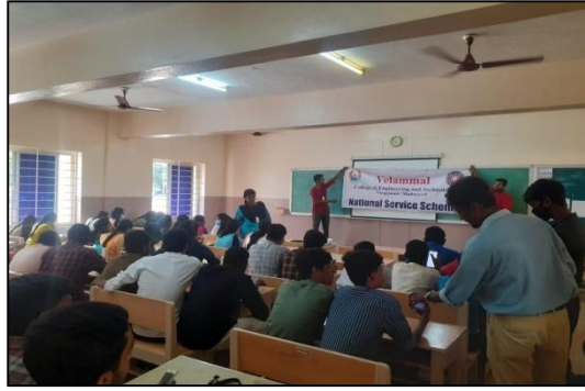
Linking the Aadhaar number with voter ID Camp program on 26.08.2022.